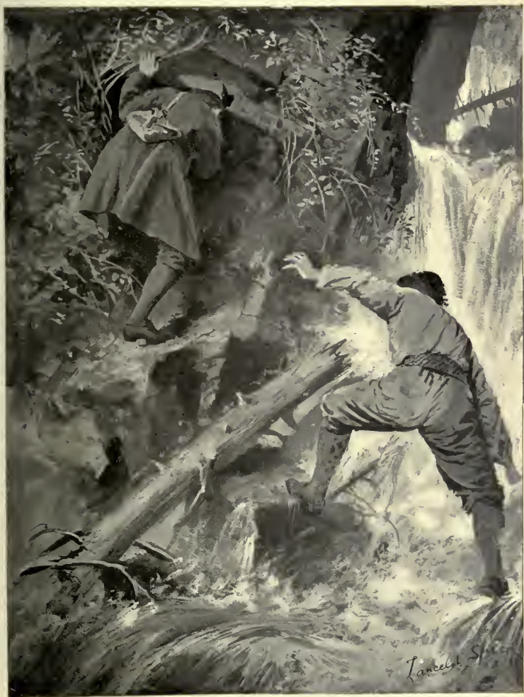
HE THREW ASIDE BUSHES, BRAMBLES AND LOGS.—Page 87.